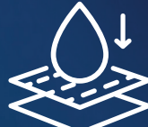
Dual Reverse Osmosis Membranes

Reduces chlorine, chemicals, and pesticides.