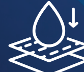
Post Carbon + Mineral Add-Back Filter

Reduces dissolved solids, pharmaceuticals, and metals.